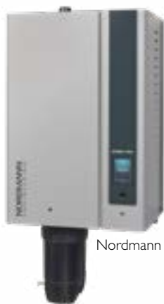
Nordmann Omega Pro