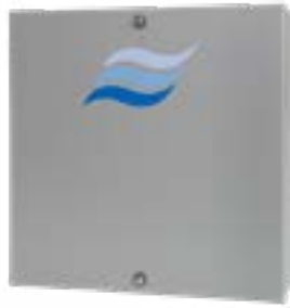
Condair Spa Control Delta

We already launched our external wellness control under the brand Condair in 2019 – no change.