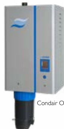
Condair Omega Pro

We just change the brand from Nordmann to Condair